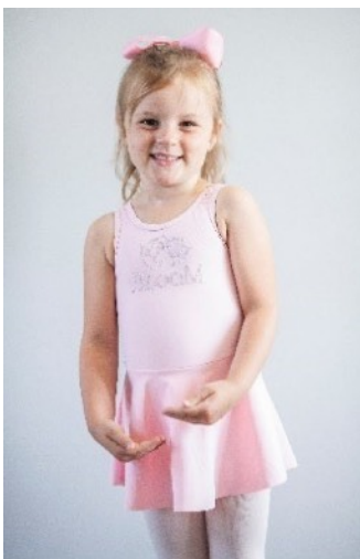
Bloom Ballet Dress

**The leotards and skirts pictured below are not required styles - shown for ideas only